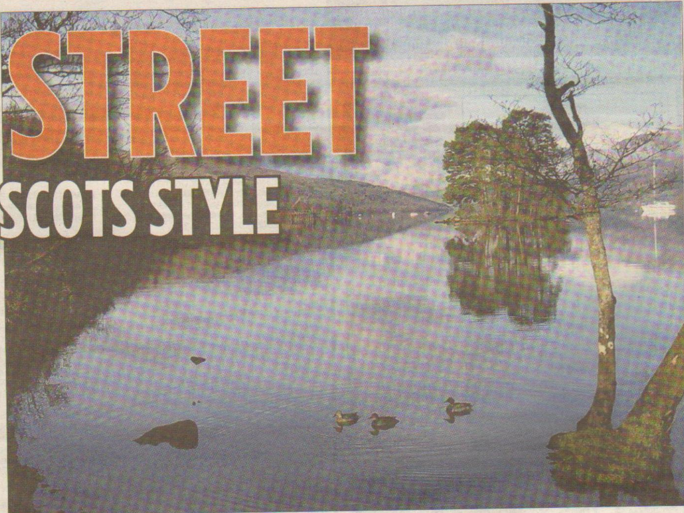
NATURE TRAIL: The splendid Loch Tay at Kenmore, and below left, a bathroom with sauna at a Mains holiday property

Five beautiful en-suite bedrooms? Check. Open-plan living area warmed by a log burner? Check. Mezzanine TV room to segregate the kids? Check. Hot tub? Sauna? Full-size pool table? Check, check