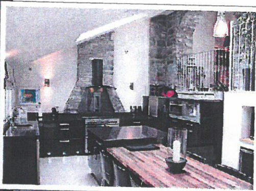
QUALITY TIME: Taymouth Country Estate, left, offers luxurious self-catering cottages, above, which include hot tubs and saunas

T HE conservation village of Kenmore lies on the banks of Loch Tay, less than a two-hour drive from Glasgow or Edinburgh. Arriving at the Mains of Taymouth Country Estate to prepare for our midweek break, I realise once again how lucky we are to have such beautiful scenery on our doorstep.