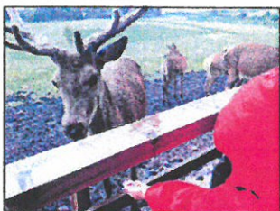
HAND-FED: Guests can feed red deer

naturally reared at 'Ewetopia' near Fortingall.