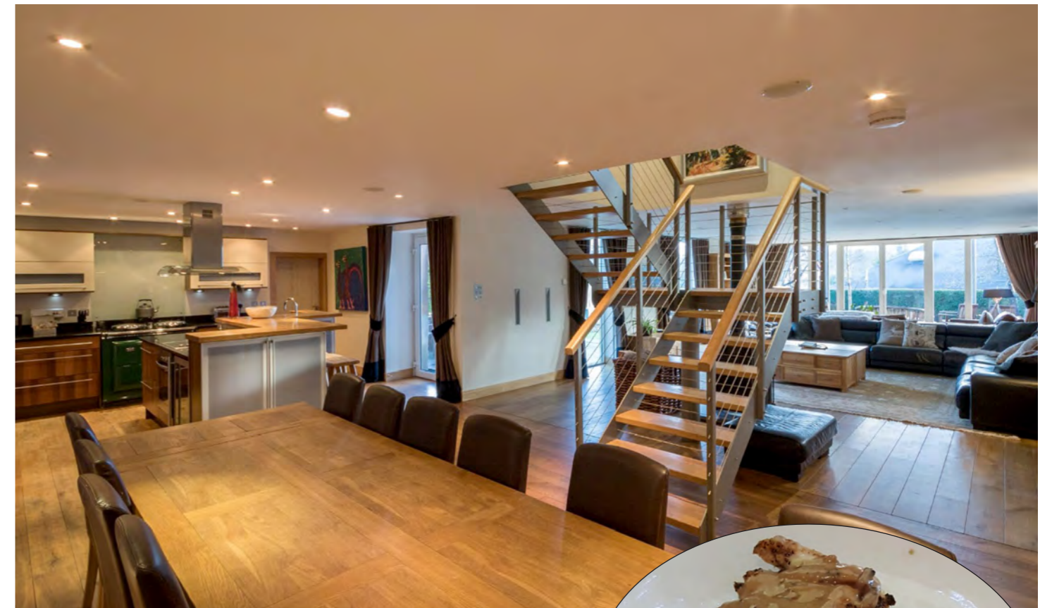
The interiors at Mains of Taymouth are of the highest standard

Back at Kenmore and a wander along the river bank where the birdsong is deafening. There are ducks everywhere, on the lawns, around the houses, but they are fearless of humans, you have to move for them –