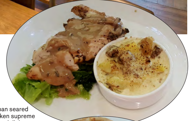
My pan seared chicken supreme was a delicious main from the varied menu

The hot tub is a welcome addition for a weekend away, it's something you are unlikely to have at home, it was in a hedged area so dashing from the cottage into the tub wasn't a race to hide Continued on page 50