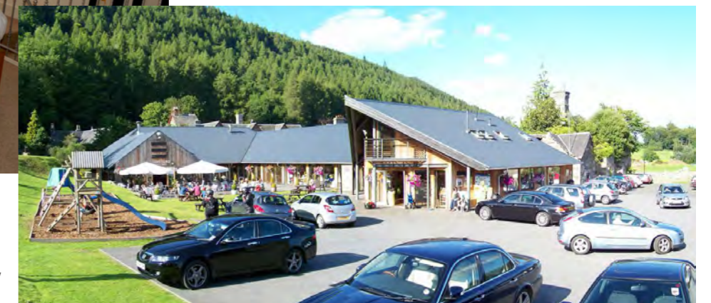
The Courtyard restaurant and gift shop/deli on a busy summer's day