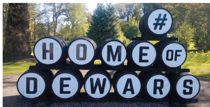
Home of Dewars, the tours were a terrific way to spend a morning