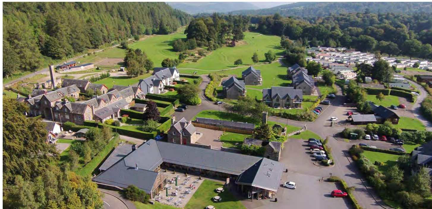
An overview of Mains of Taymouth Country Estate and golf course