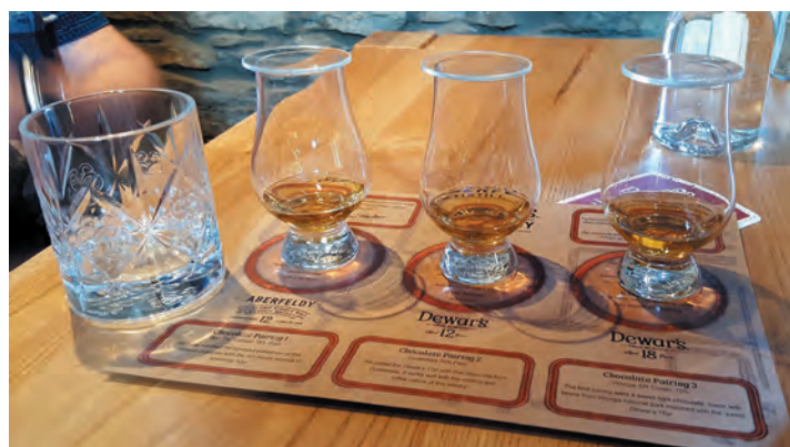
Let the sampling begin at the Dewars tour. Aberfeldy malt, and two Dewar's blends, a 12-year-old and an 18-year-old