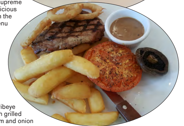
The 8oz ribeye steak with grilled mushroom and onion rings