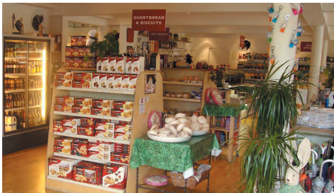
The interior of the Courtyard shop which is on the estate

I ordered the pan seared chicken supreme at £14.95, which came with with a potato and haggis gratin, savoy