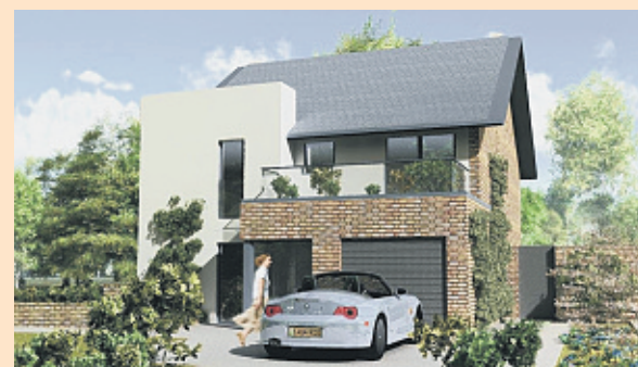
Merchant Homes plan for Philipshill Gardens, left; a Taylor Wimpey Heartland home, bottom