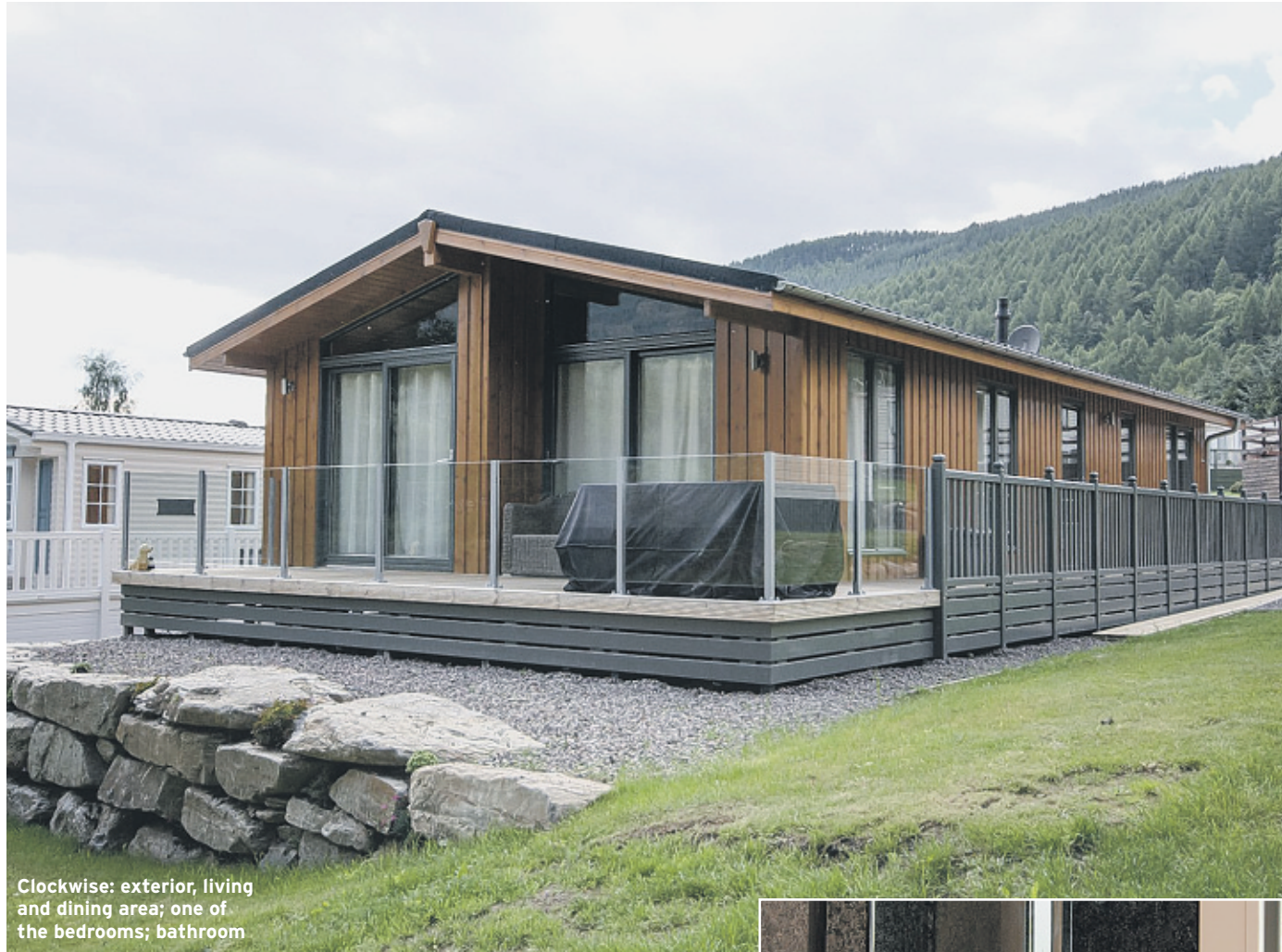
Clockwise: exterior, living and dining area; one of the bedrooms; bathroom

Tara Scott, Managing Director of Mains of Taymouth Estate, says: "This new generation of Riverside lodges has been designed to complement surrounding scenery and properties. There were only 16 lodges in the first phase, which is testament to the exclusivity of the development. We offer the highest quality of properties in one of the most desirable locations in Perthshire easily accessible to those in the Central Belt and Highlands. What makes these new lodges especially appealing is the customised design and layout. No two properties are the same."