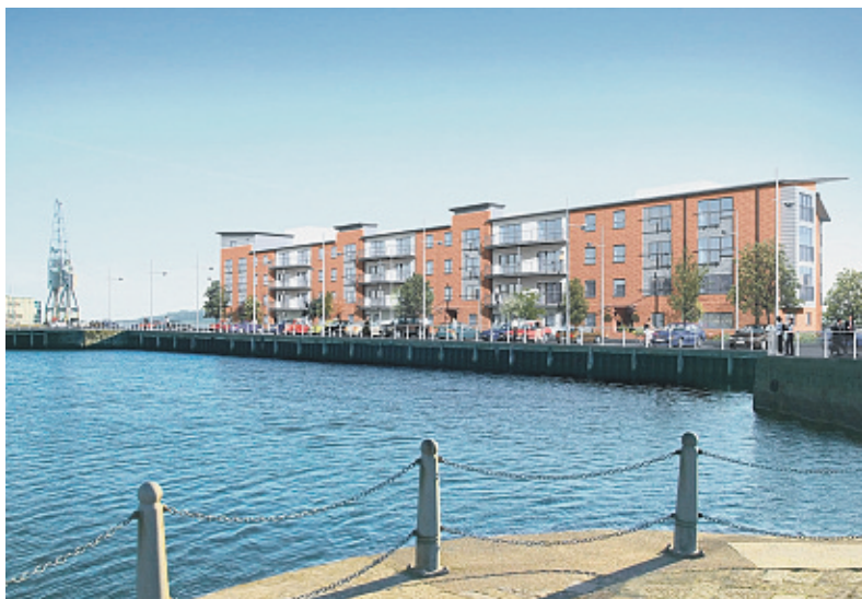
City Quay from Miller Homes, above, and the firm's Varsity South, opposite