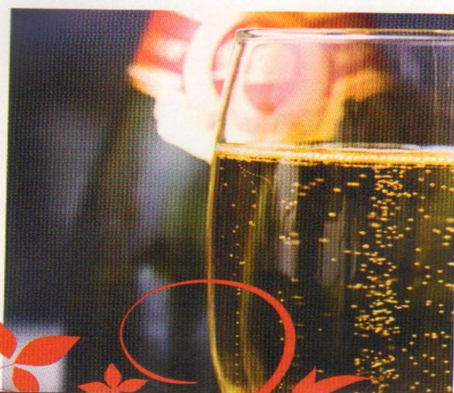
Clockwise from top left: The seductive white beaches of the Outer Isles; Hand in hand on the sand; Food for lovers; Champagne to mark the occasion.